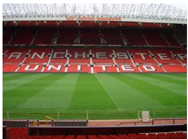
Old Trafford Football Ground

Rossall is located just under one hour away from Manchester. With the decline of traditional industries, Manchester has developed into a regional commercial centre of considerable importance. It has excellent shopping malls together with theatres, concert halls and cultural attractions that rival those of London, as well as being the home of the famous “Manchester United”. Its international airport is the UK’s busiest outside the capital and it has direct daily services to Europe, the Middle East, the Asian sub-continent, South East Asia and North America.