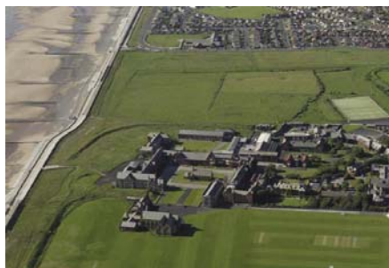
Rossall Campus by the Shore

Rossall is very much at the centre of a region with a rich cultural heritage. The medieval cities of Chester and York are easily accessible by road and rail. Two of Britain’s finest national parks are also close at hand. The Lake District, with its historic connections with famous English literary figures, is just one hour away whilst the Yorkshire Dales is equally accessible: both provide excellent potential for outdoor activities.