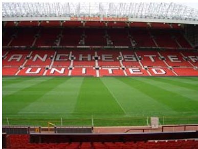
Old Trafford Football Ground

Rossall is located just under one hour away from Manchester. With the decline of traditional industries, Manchester has developed into a regional commercial centre of considerable importance. It has excellent shopping malls together with theatres, concert halls and cultural attractions that rival those of London, as well as being the home of the famous “Manchester United”. Its international airport is the UK’s busiest outside the capital and it has direct daily services to Europe, the Middle East, the Asian sub-continent, South East Asia and North America.